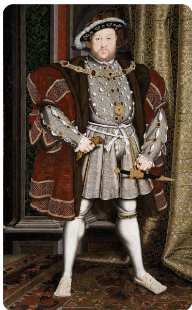
King Henry VIII

6. A long time ago, kings and queens made rules for the country.