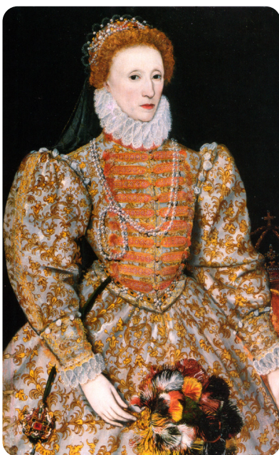
Queen Elizabeth I