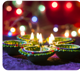
Diwali diva lamps