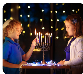
Hanukkah menorah candles