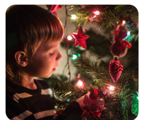
Christmas tree lights