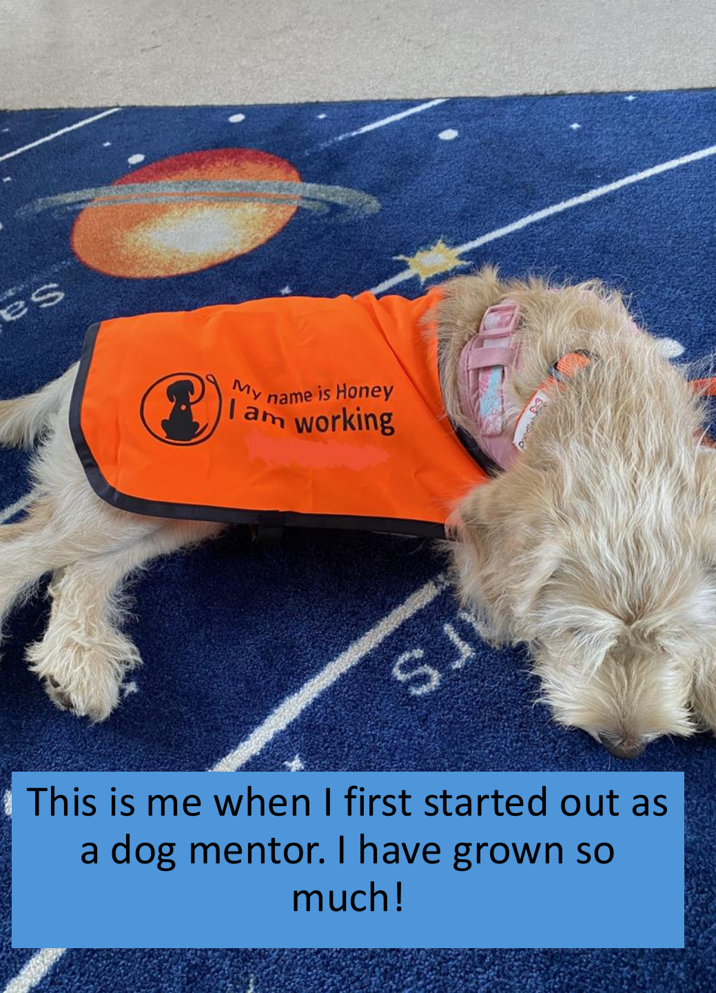
This is me when I first started out as a dog mentor. I have grown so much!